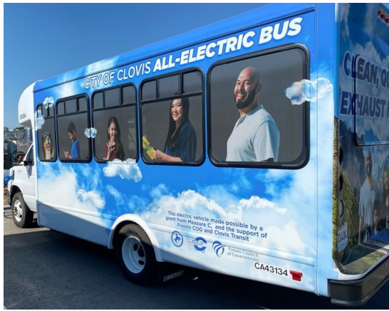
Round Up All-Electric Bus