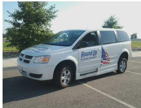
Round Up Wheelchair Van

For trips outside of the Fresno service area or between Fresno addresses, passengers can coordinate with Fresno Handy Ride. See the map on the reverse side for the service area boundaries.