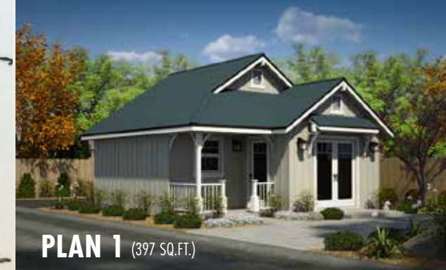
PLAN 1 (397 SQ.FT.)