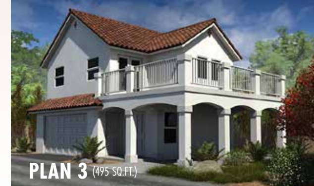
PLAN 3 (495 SQ.FT.)