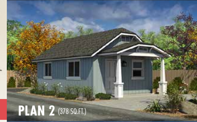
PLAN 2 (378 SQ.FT.)